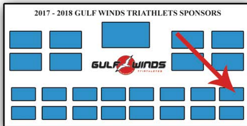
LOGO ON LARGE BANNER