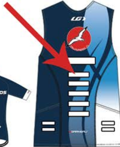
LOGO ON TRI TOP