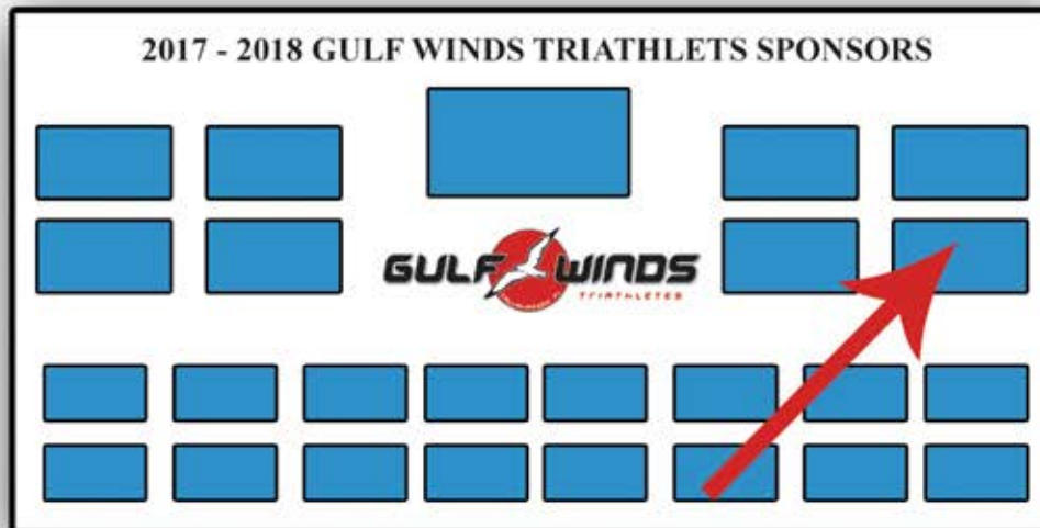
LOGO ON LARGE BANNER