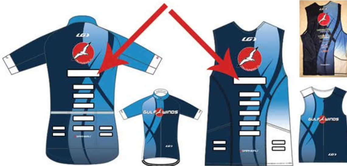
LOGO ON CYCLING JERSEY