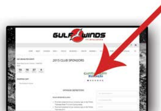
LOGO ON WEBSITE

*Uniform & shirt design shown is based upon 2015-2016 kits. 2017-2018 kit design may change.