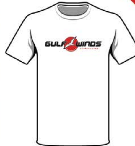
LOGO ON CLUB T-SHIRT