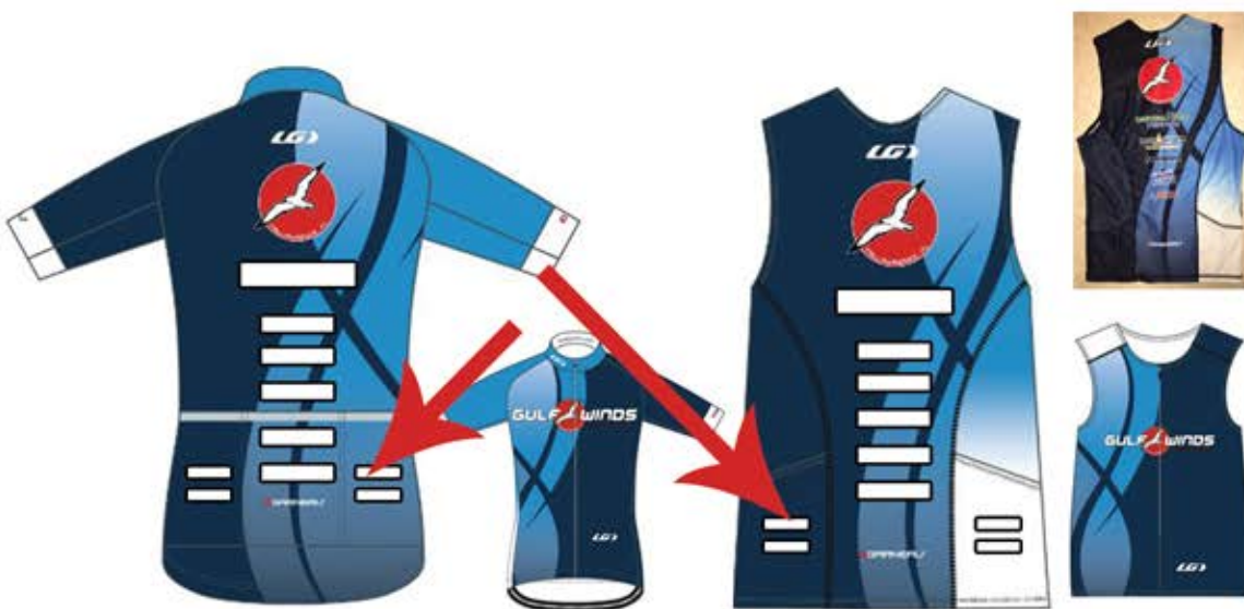
LOGO ON CYCLING JERSEY