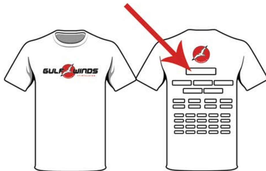
LOGO ON CLUB T-SHIRT