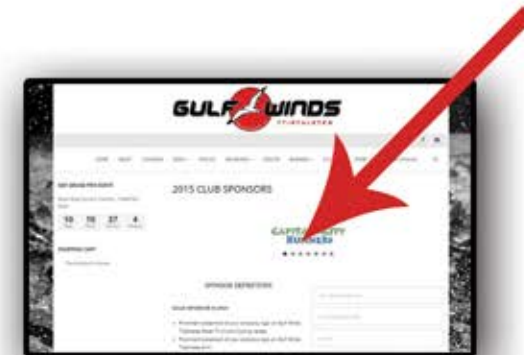
LOGO ON WEBSITE

*Uniform & shirt design shown is based upon 2015-2016 kits. 2017-2018 kit design may change.