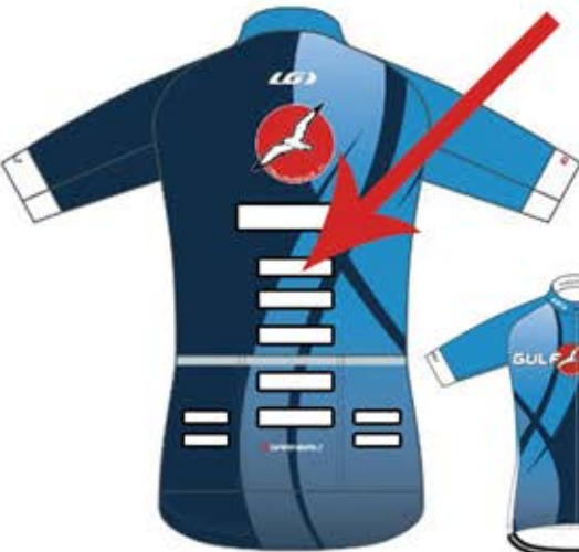
LOGO ON CYCLING JERSEY