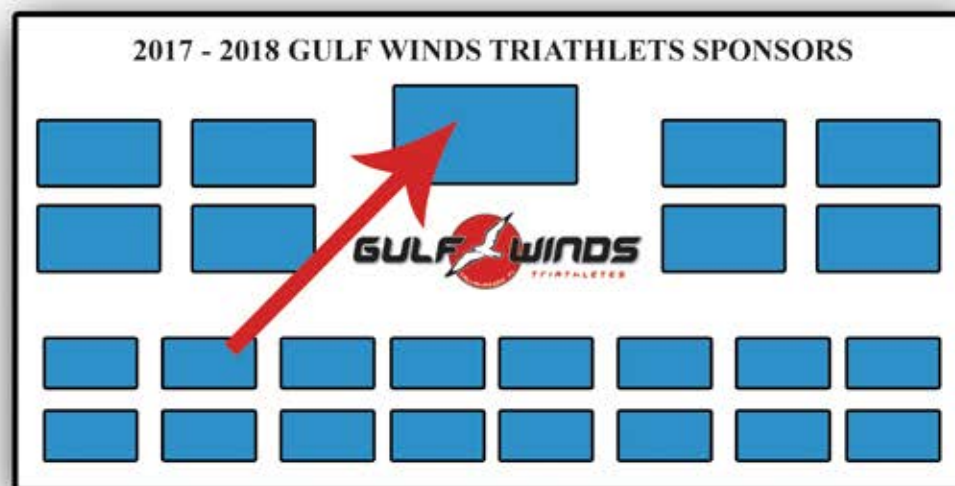
LOGO ON LARGE BANNER