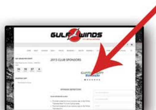
LOGO ON WEBSITE

*Uniform & shirt design shown is based upon 2015-2016 kits. 2017-2018 kit design may change.